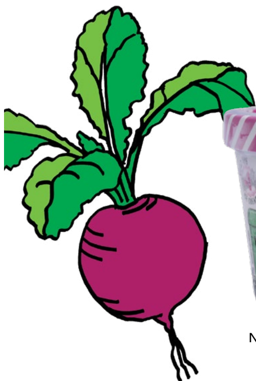
New City Microcreamery ICE CREAM $7.69