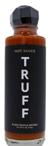
Truff HOT SAUCE $9.99