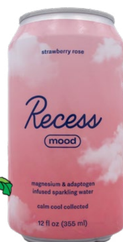
Recess ADAPTOGEN SPARKLING WATER $2.99