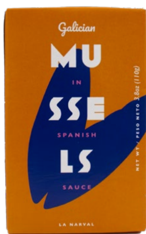
La Narval MUSSELS IN SAUCE $5.99

There are over 300 products on sale in our stores in September, and each month we choose our favorites.