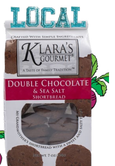
Klara's COOKIES 2 for $9