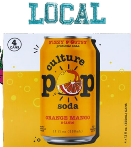
Culture Pop PROBIOTIC SODA 4-PACKS $5.99