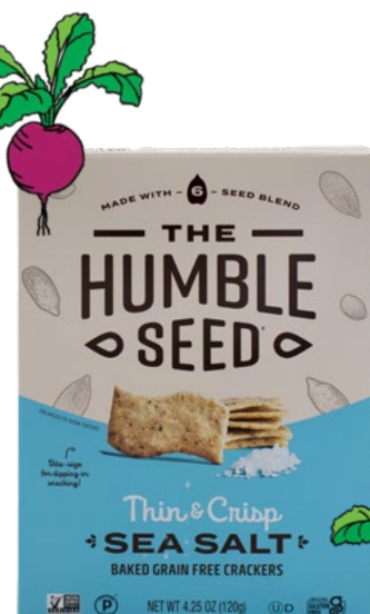
The Humble Seed CRACKERS $4.99