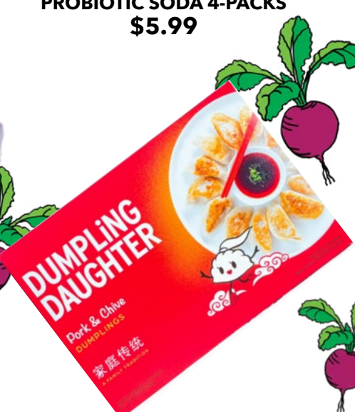
Dumpling Daughter FROZEN DUMPLINGS $4.99