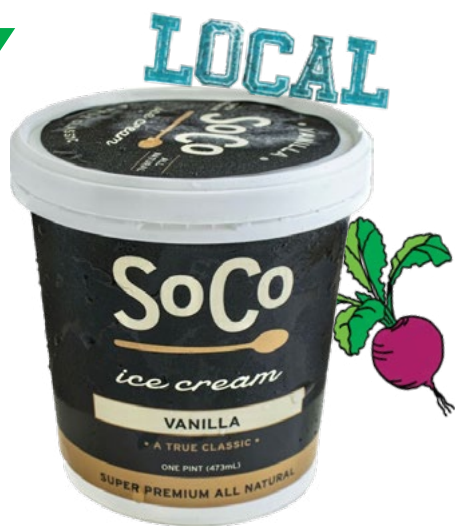
SoCo ICE CREAM $4.99

There are over 300 products on sale in our stores in July, and each month we choose our favorites.