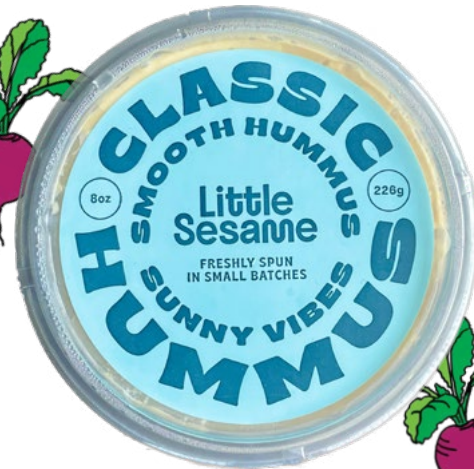
Little Sesame HUMMUS $3.99