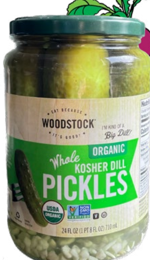
Woodstock SELECT CONDIMENTS & PICKLES $6.19