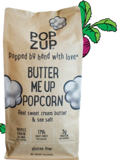
Popzup POPCORN $5.49