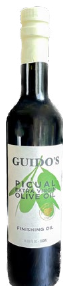
Guido's PICUAL OLIVE OIL $19.99