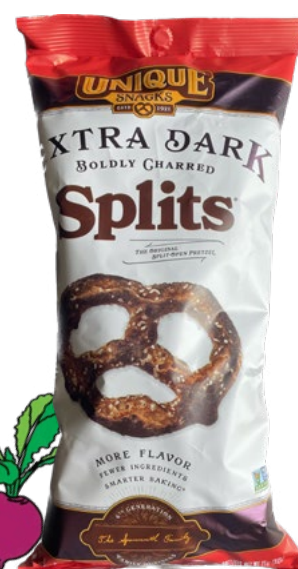
Unique PRETZELS 2 for $6