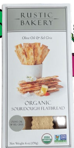
Rustic Bakery FLATBREAD CRACKERS $5.99