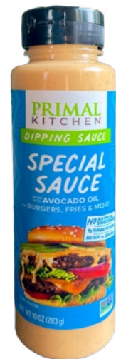
Primal Kitchen DIPPING SAUCES $8.49